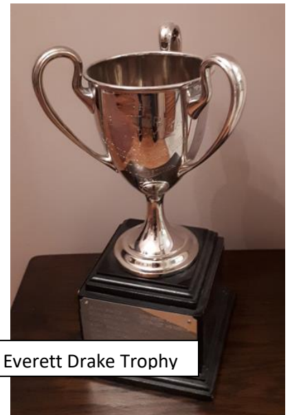
The Everett Drake Trophy