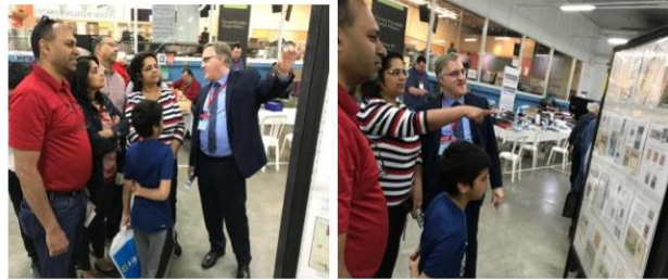
Explaining an exhibit to visitors/attendees at the show

Congratulations are due, to all Exhibitors at Orapex 2019 for winning the different awards as a lot of thought and hard work were evident in the displays which were of exceptional quality. Special thanks must also be attributed to the Judges who did a remarkable job in their evaluations and later in explaining to the exhibitors their thoughts on the reasoning behind their respective judging scores.