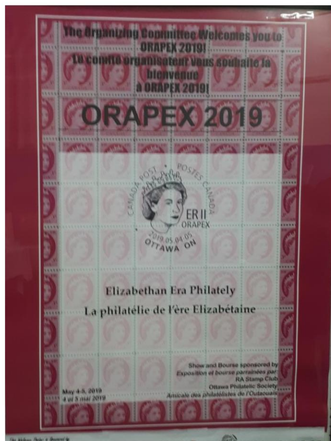
Elizabethan Era Philately, the theme of the show