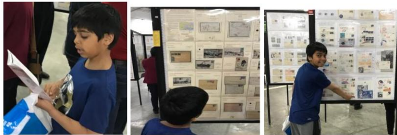
A youngster reviewing the Orapex 2019 Program literature and absorbing the exhibits on display; finally excited to show his brother and parents an item of his interest!

In closing, I must mention that one of the great pleasures I find in stamp collecting is the ability to appreciate the very many exhibits of different collectors. The differences that can be viewed around the style of exhibiting is highly rewarding when