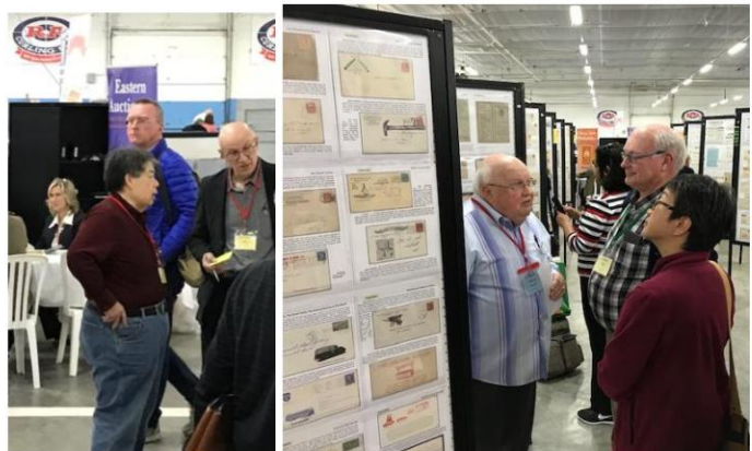
Judges & Exhibitors sharing views and scoring decisions about their respective exhibits

viewed as a storyline and as showcased by each exhibitor's narrations, relevant postal description and images, taking viewers on a captivating journey.