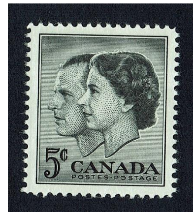
ROYALTY ON CANADIAN STAMPS — 5-cent commemorative issued for 1957 visit to Canada by Queen Elizabeth II and Prince Philip