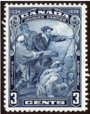
EXPLORER — Explorer Jacques Cartier on 3-cent large-format 1934 Canadian commemorative