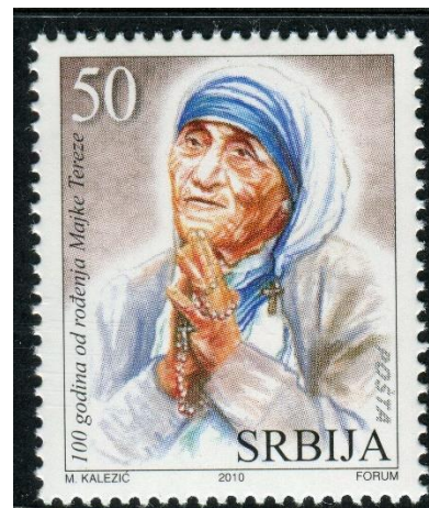
HUMANITARIAN — Mother Theresa, on 2010 commemorative issued by Serbia.