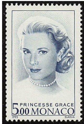
FILM STAR — Princess Grace, a U.S. movie star who married the Prince of Monaco, on a 1993 5-franc Monaco commemorative.