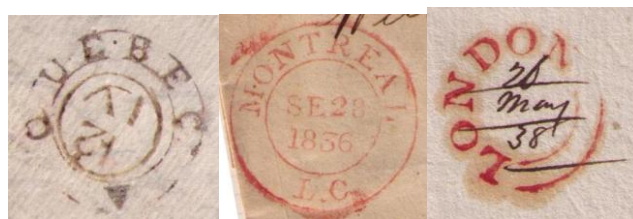
Quebec 'Bishop Mark' circular postmark 1789 (left); Red double-circle Montreal, L.C. 1836 postmark (middle); Red London 1838 'broken circle' postmark with manuscript date (right)