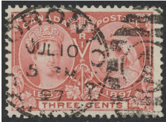
Toronto '1' Duplex JUL 10 97 postmark on 3-cent Jubilee