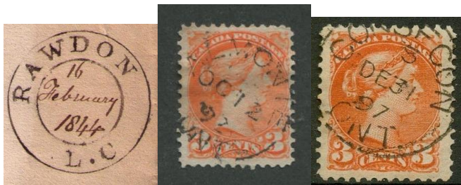
Double circle postmark from Rawdon, L.C. (Lower Canada – precursor to Quebec province) with 1844 'manuscript' dating (left); Almonte, Ont. split ring circular cancel Oct. 12, 1892 on 3-cent Small Queen (middle); Consecon, Ont. Dec. 31, 1897 circular postmark (village post office still exists)