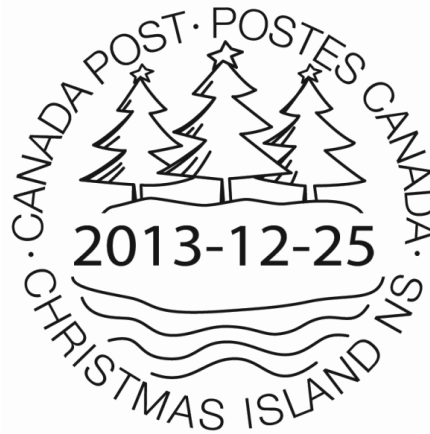
Christmas Island, Nova Scotia special postmark 2013