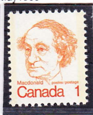
Issued 29th June 1927 17th October 1973