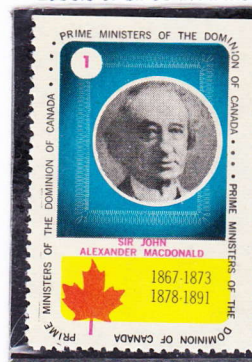
Issued to celebrate Canada 1967 ▲