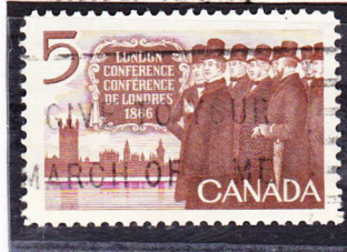
Issued 26th May 1966