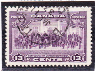
Issued 1st June 1935