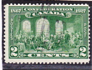
Issued 29th June 1927