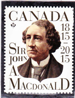
Issued 10th January 2015