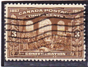
Issued 15th September 1917