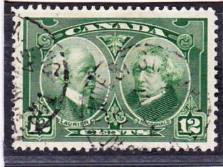
Issued 29th June 1927