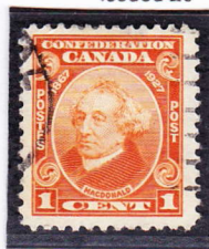
Issued 29th June 1927 17th October 1973